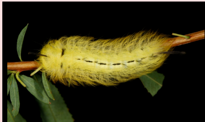
Spotted Apatelodes Moth